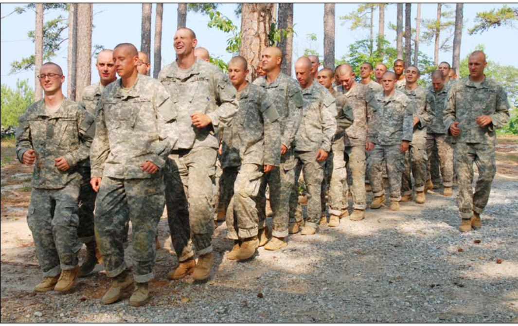
The most important habit every prospective Ranger School student should have is a daily physical fitness regimen that focuses on running, rucking, and upper body strength.

The most important habit every student should have is a daily physical fitness regimen that focuses on running, rucking, and upper body strength. Potential students should include several days of running and at least one day of foot